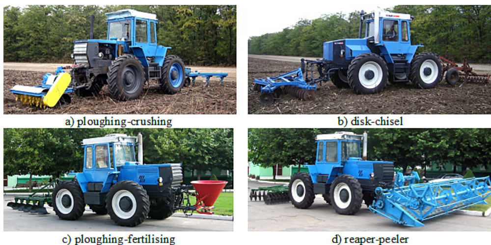
Fig. 3. Experimental combined machine-tractor aggregates; a) ploughing-crushing, b) disk-chisel, c) ploughing-fertilising, d) reaper-peeler

The third scheme for assembling the combined machine-tractor aggregates is the most promising. The advantages of such aggregates are that the mass and traction resistance of the frontally mounted sections of the machines or implements increase the vertical load upon the front traction wheels of the means of energy, increase their adhesion to the soil and reduce towing. As a result, the conditions for using the power of the means of energy improve due to the redistribution of loads across its bridges, labour productivity increases, and specific fuel costs are reduced. In many cases, the metal consumption and the kinematic length of the aggregate are reduced, which leads to a decrease in the width of the headland and the non-productive losses of time during the movement of the combined machine-tractor aggregate on it. However, to assemble combined machine-tractor aggregates according to such a scheme, an energy device with a frontal hitch is required. It is quite desirable that it also have a front PTO shaft, a reversible control post or reversible transmission, an engine with two power levels, etc. On the basis of experimental tractors, a number of schemes of the new promising combined machine-tractor aggregates were developed (Fig. 3).